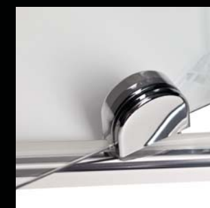
Polished Frame and Hardware