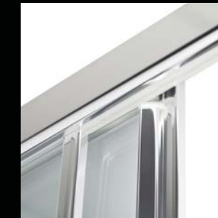
Hidden Top Rails