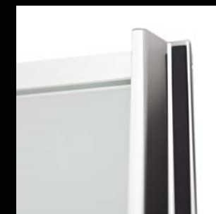
Magnetic Close Handle