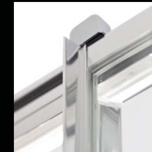
Polished Frame and Components