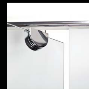
Frameless Patch Pivot