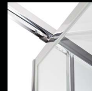
Static Position Open and Close Pivot