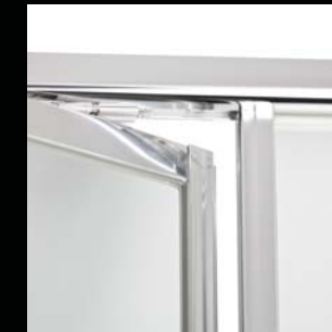
Framed In-line Pivot

See back of brochure for details on size limitations and examples of configurations.