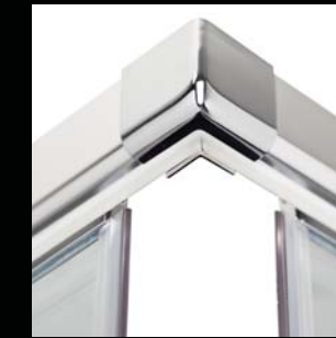
S/F Frame Corner

See back of brochure for details on size limitations and examples of configurations.