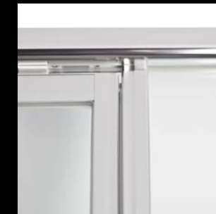
Water Blocking Stile