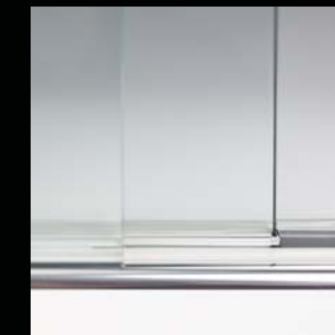
Frameless Panel Overlap