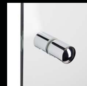
26mm Door Knob