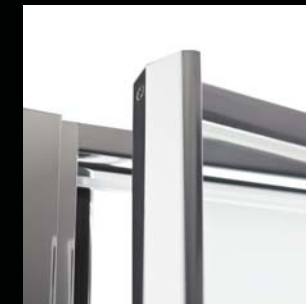
Full Length Handle Stile