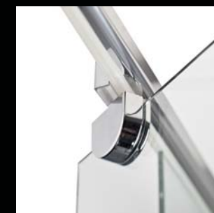
Innovative Offset Pivot