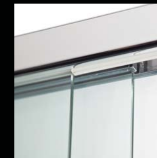
Sturdy Head Frame