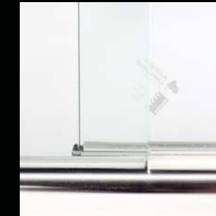
Hidden Bottom Rails