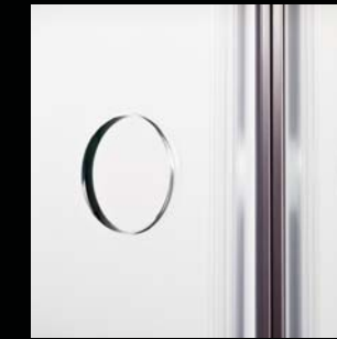
Polished Handle Hole