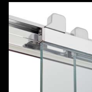
Single Roller Track